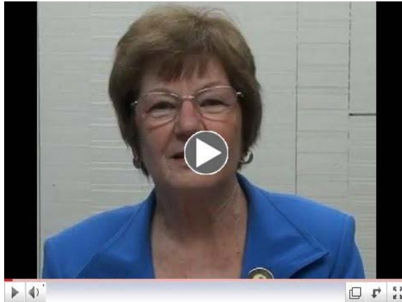
New Club Year!