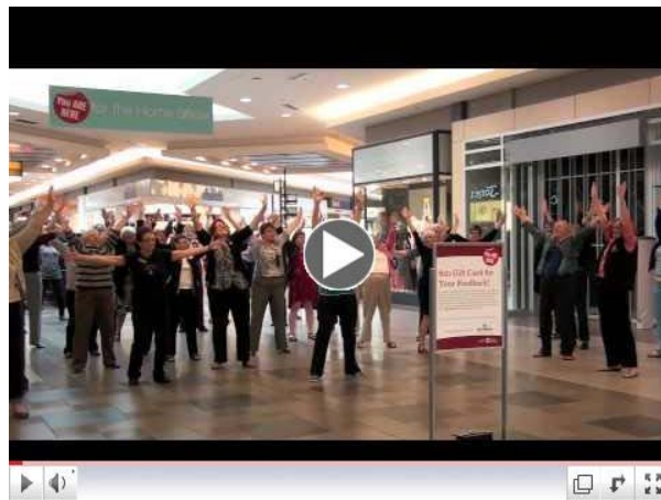
Soroptimist Flash Mob Video

Have you ever participated in a flash mob? As part of their fall leadership meeting, Western Canada Region members organized a flash mob in their local mall. Club members did a choreographed dance and held signs with the Soroptimist web address to raise awareness of the organization. Click below to see Western Canada Region members in action.